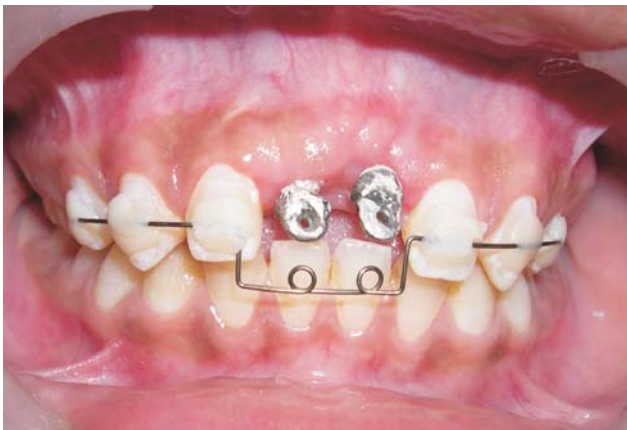
Fig.02: Appliance bonded in mouth