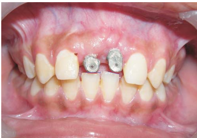
Fig.04A: Pre-extrusion intra oral frontal photograph