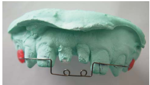
Fig.01: Appliance fabricated on Maxillary Cast

Author's Affiliation: *Reader, Department of Orthodontics, PDM Dental College & Research Institute, Sarai Aurangabad, Bahadurgarh Haryana - India, **Professor, Department of Orthodontics, PDM Dental College & Research Institute, Sarai Aurangabad, Bahadurgarh Haryana.