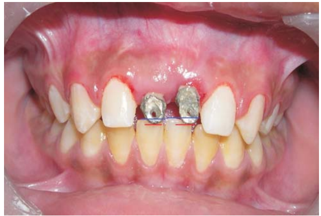
Fig. 04B: Post-extrusion intra oral frontal photograph