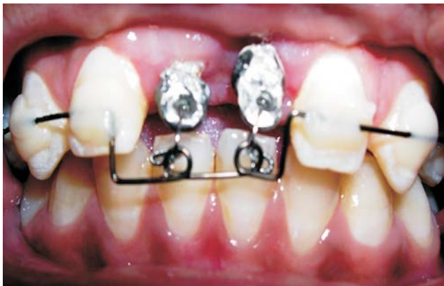
Fig. 03: Appliance activated by tying ligature wire